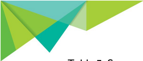
Table 3: Success Criteria, Level AAA

Notes: We have not tested to this standard level.